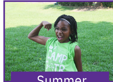
Summer Camp Options