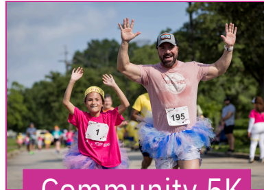
Community 5K Celebration